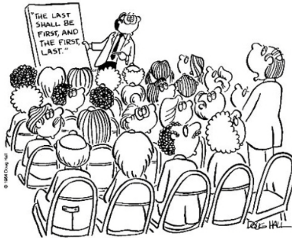
"I don't want to be first or last. I want to wallow somewhere in the middle."